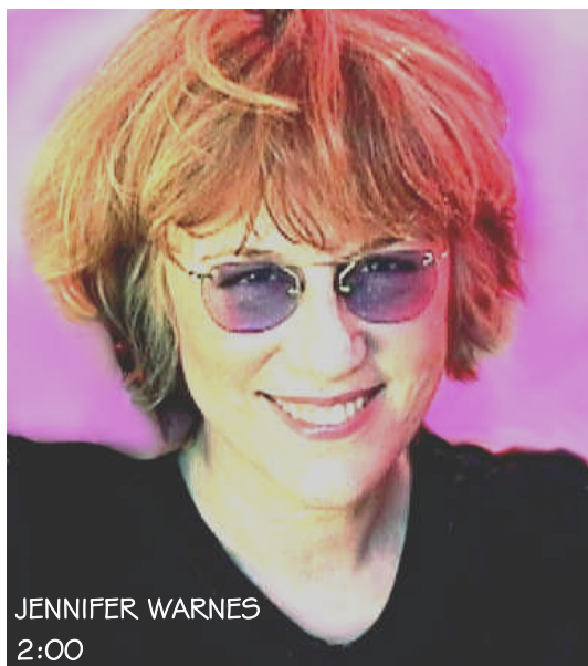
JENNIFER WARNES 2:00